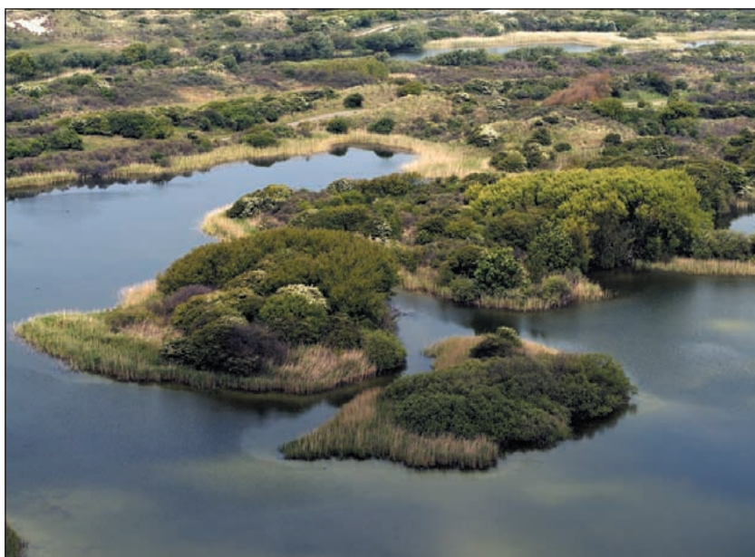
Figure 1. Artificial lakes covering coastal dunes represent ecologically designed systems to provide drinking water for large cities in the Netherlands.

There is a pressing need for further collaborations between ecologists and corporations, governmental agencies, and advocacy groups, at local and international levels. Business practices have substantial impacts on the environment, but if informed by ecological knowledge,