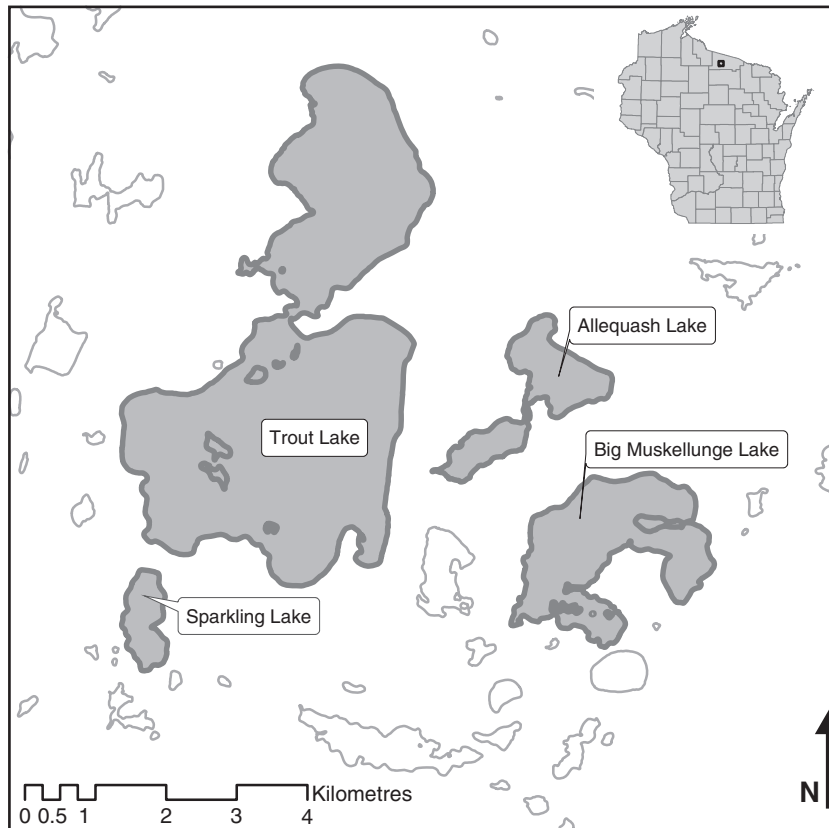
Fig. 1 Map of study area showing the locations of four lakes in northern Wisconsin, U.S.A. (inset), in which littoral coarse wood was sampled in 1996 and in 2003.

the following criteria: \geq 15 cm in diameter (at widest point of log or at shoreline), \geq 200 cm in total length (150 of which must be at least partially submerged), and found within 25 m of the shore or in \leq 1 m of water. In 2003, we walked much of the shoreline and used forestry calipers to measure logs, while in 1996 the survey was done primarily from a boat using homemade calipers.